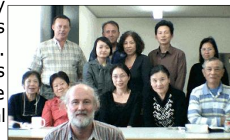
The Centre has "other fun things" like a Social English Class

If you would like to contribute to the next The Last Word... email wpc@wpc.net.nz